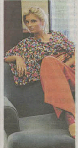
One of the outfits that will be worn by House of Frog models during the Art on Track exhibit, which will be presented on an eight-car L.

"If anything, it will mean that the quality of the work is a lot better," he says. "For most of us, this is one of the greatest art shows to be attached to; it's a great way of branding yourself as a gallery or an artist."