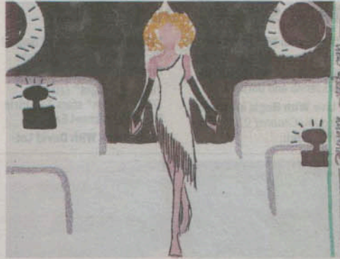
This artist's sketch shows the runway for the House of Frog fashion show and performance art presentation on Saturday.